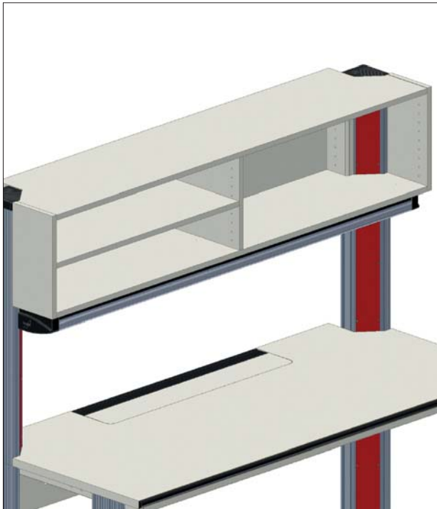
Shelf unit rack