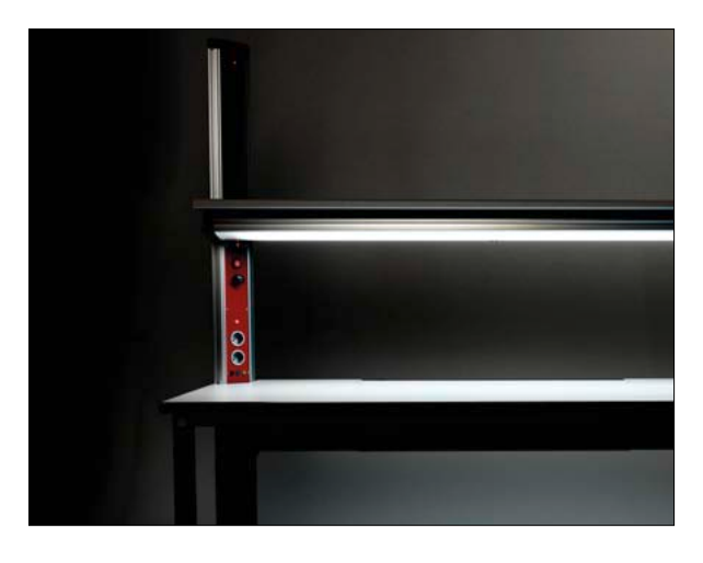
Perfect illumination of the work area Adjustable and features individual luminous colour in LED technology, energy-saving and durable.

The front table legs can be shifted as a standard feature – ensuring more legroom. The Primus One® fits directly and flush to the wall. Baseboards are not a problem.